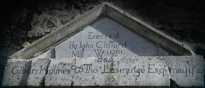
Date stone on the west side of oat mill (1769).