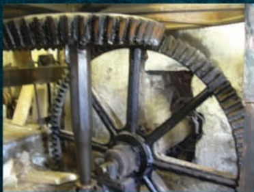
The pit wheel and wallower transmit power to the grinding stones

The Grand Canal came through Belmont in 1803, providing a vital transport link to Dublin. Visit the rare double chambered lock nearby.